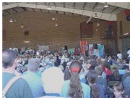
Hanger seating about 1.5 thousand for the dedication

Recently we were privileged to attend the New Testament Celebration of the Gullah language (Yes, the one from Nickelodeon's show Gullah Gullah Island ). As you may