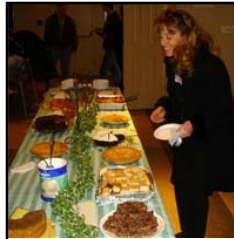
We had a scrumptious selection of desserts

Back in November we invited family, friends, and churches to come to an evening presentation called “Details and Dessert.” The purpose was to better explain the vision for a missionary kid ministry. We were very encouraged as around 50 people showed up for the event.