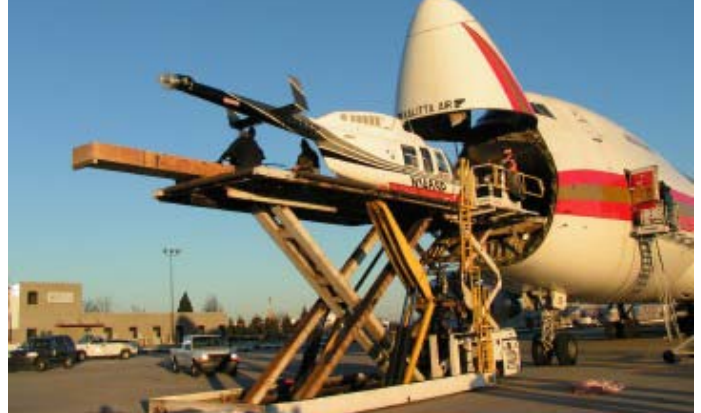
JAARS helping to load a Helicopter into a Samaritans Purse Plane!

For Financial Gifts - Note For Ministry of Caryl Mallory Wycliffe Bible Translators PO Box 628200 Orlando, FL 32862-8200 1-800-WYCLIFFE www.wycliffe.org